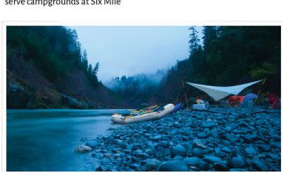
Pitching camp on the Wild and Scenic Illinois River.

The small town of Selma offers groceries, fuel and a post office. Deer Creek Vineyard's award-winning wines are just a few miles down Deer Creek Road. Finally, Josephine County's Lake Selma Park off of Lakeshore Drive provides a place for hiking, camping, picnicking, equestrian riding, fishing, and a disc golf course.